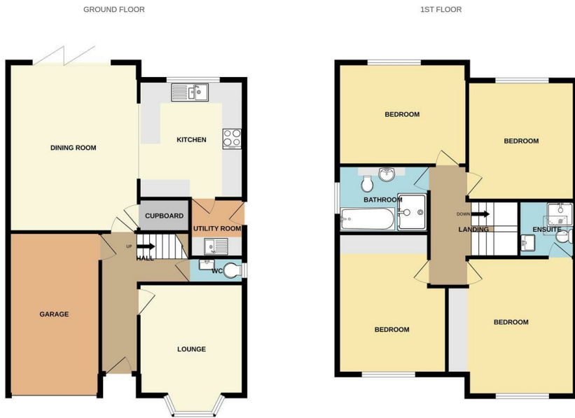
PLOT 1 61 BELMONT AVENUE, BREASTON

While every attempt has been made to ensure the accuracy of the floorplan contained here, measurements of doors, windows, rooms and any other items are approximate and no responsibility is taken for any error, omission or mis-statement. This plan is for illustrative purposes only and should be used as such by any prospective purchaser. The services, systems and appliances shown have not been tested and no guarantee as to their operability or efficiency can be given. Made with Metropix CS022